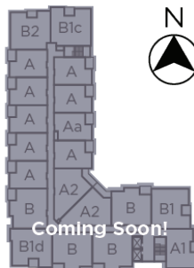
Levels 2 - 5