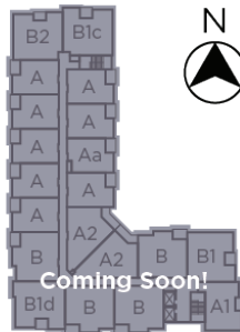
Crossing At Belmont West